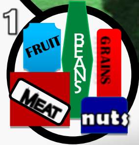
Protein rich food

Protecting the people we care about most