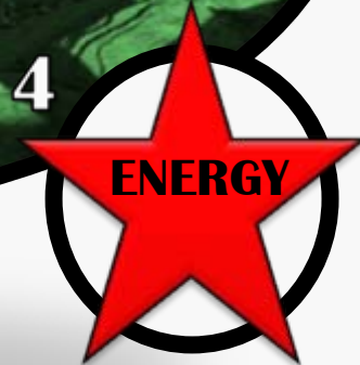
Enzymes break proteins to release Energy