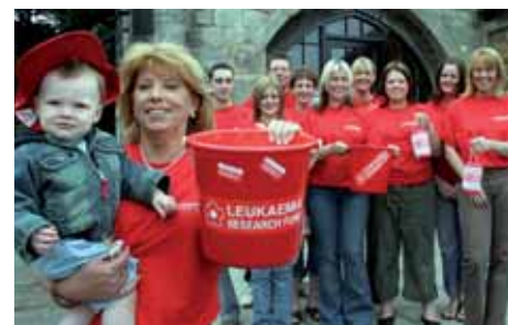
Raising awareness of leukaemia Leukaemia Research Fund

The European Union has reduced the maximum level of benzene permitted in petrol from five to one per cent. Current UK air quality legislation sets an ambient air objective for benzene (by the end of 2010) of 5 µg/m 3 in England and Wales, and 3.25 µg/m 3 in Scotland and Northern Ireland.