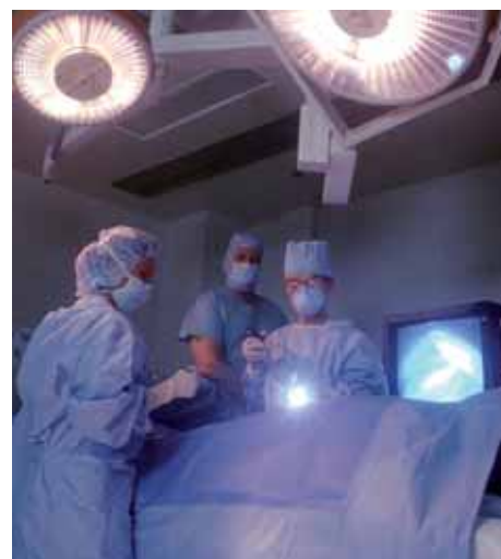
MRSA research feeds into healthcare policy

More money is also being allocated to increase mobility of scientists between member states. I am a keen advocate of