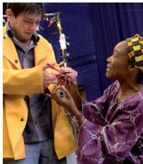
An anguished moment from Mind the Gap Y Touring