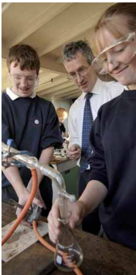
Piloting the new course at Settle College, North Yorkshire

For science teachers one message is clear: some major changes and challenges are on the horizon.