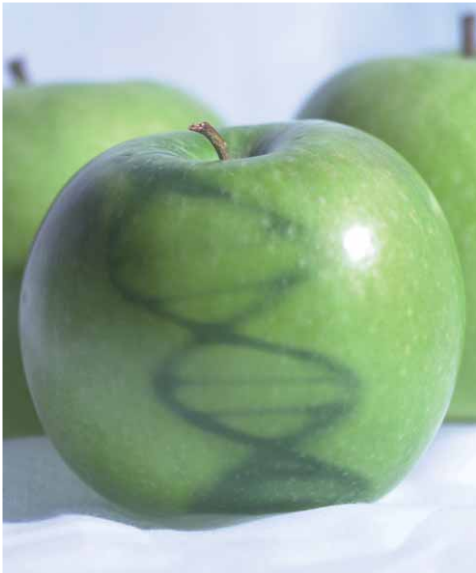
Keeping the doctor away: is nutrigenomics the answer?