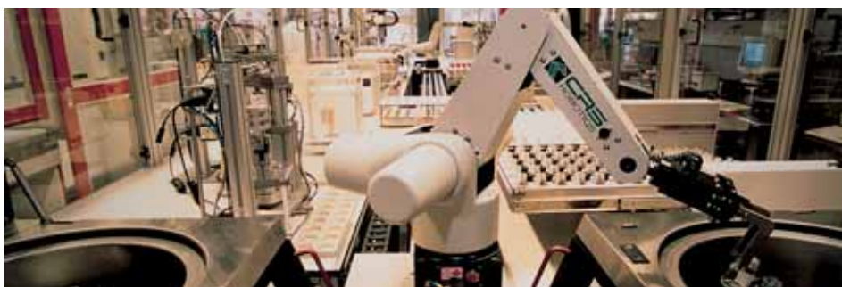
Testing new chemicals: parliamentarians need scientific advice Bayer

I am a member of the European Parliament's Committee on Environment,