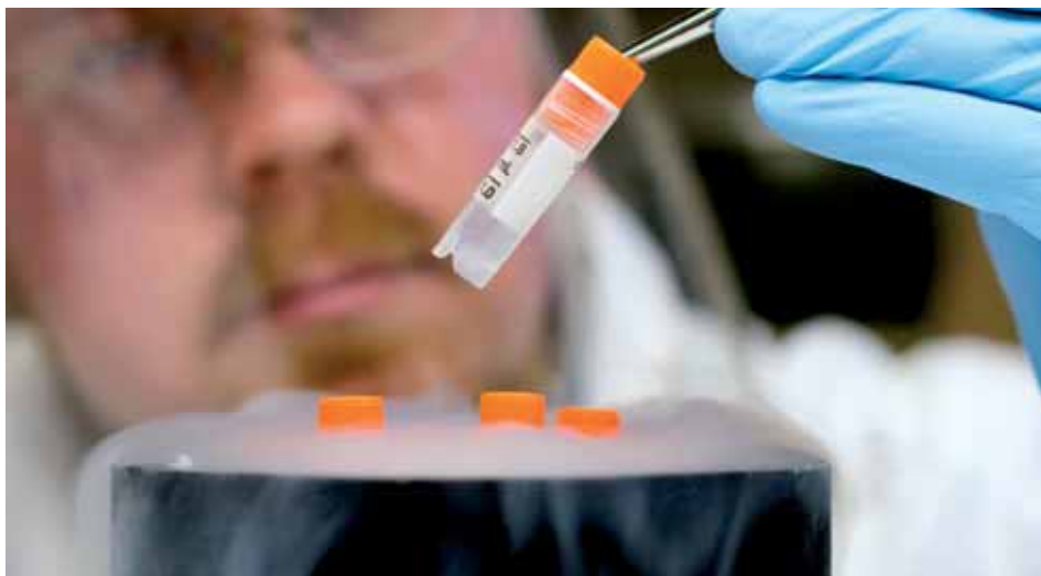
Each experimental step should be open Andrei Tchernov

Obviously actual practice does not meet these ideals fully. Parochialism, special-