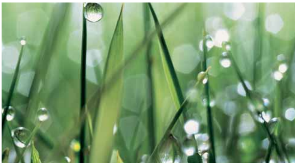
Breeding rice sprouts: genes crucial to agriculture

In recent years the flow of material among breeders and farmers has dwindled considerably. The Treaty loosens the regulatory log-jam by establishing a multi-lateral system for access and benefit-sharing. A single variety may have hundreds of ancestors from scores of countries in its pedigree. Rather than having to sign scores of bilateral agreements,