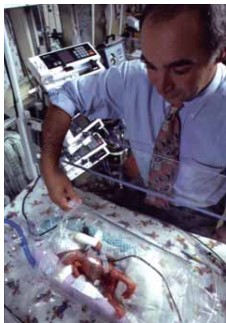
Delicate future? The UK needs to retain experts in science and medicine

In the UK we cannot afford to be complacent about the resilience of our STEM base nor of the related knowledge and skills formation. Our accumulated expertise is at