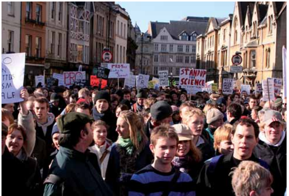
Pro-Test: standing up for science

One of the things that insults me most is their proclamation that animal research is somehow 'unscientific', yet they are not