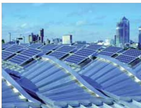
Will the UK grid cope with generation from small-scale renewable sources? Solar Century

The intermittent nature of renewables, particularly wind turbines, will make control of the transmission grid especially difficult because all generators in the system have to be synchronised. Furthermore, the system must be actively controlled and balanced to exacting standards for frequency and voltage, set and regulated by Ofgem, the body which