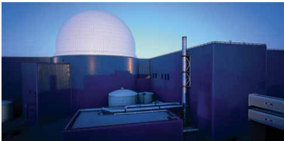
The white paper should clarify nuclear's future