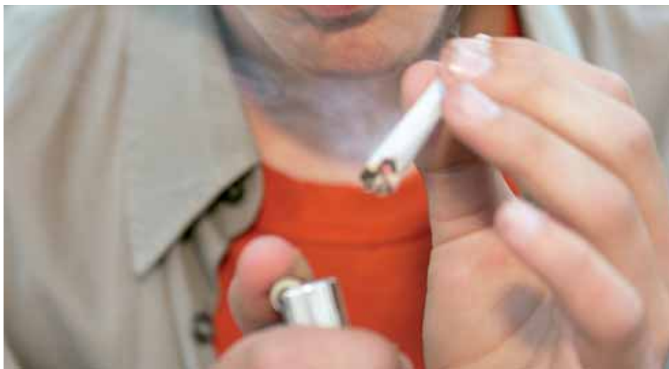
Reclassification of cannabis: clear information needed

We were also disappointed to find that the ACMD had focussed disproportionately on the provision of advice to the Home Office. The Department of Health and Department for Education and Skills clearly have pivotal roles to play in delivering the government’s drug policy targets and it is essential that approaches to treatment and prevention are firmly rooted in evidence. We concluded