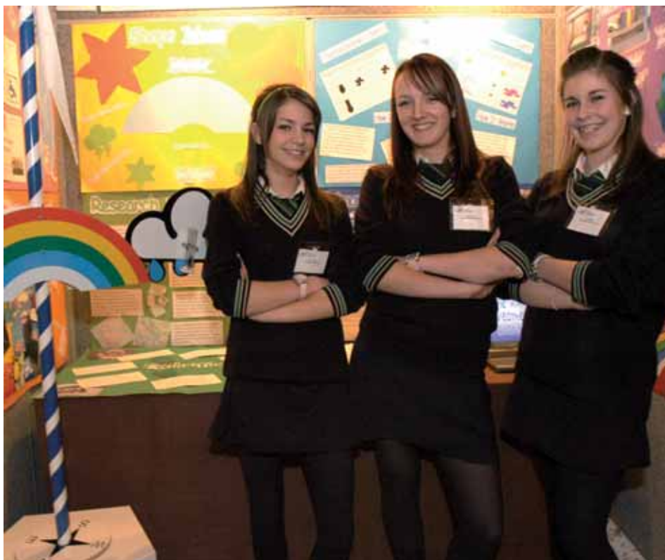
Smiles all round at the BA CREST Science Fair

The first issue has been the need for greater concern about global warming. I believe that the past year has seen a clear shift in public perceptions of the prospect of climate change. I say 'prospect' rather than, as I would