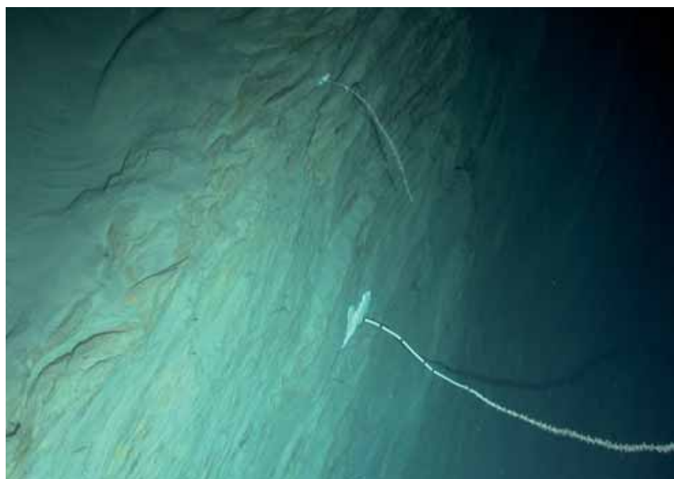
Bamboo coral grows from the side of an underwater cliff, proving that the cliff was not formed by seabed movement during the Boxing Day earthquake SEATOS Scientific Party

Piecing together the events that generated the tsunami has a forensic feel and a colleague nicknamed our efforts CSI: Deep Sea in reference to TV's popular Crime Scene Investigation series. Our expedition was actually funded by the BBC and Discovery Channel to make a documentary. We could not have got out there so quickly if the TV companies had not made it happen, as the carefully considered peer-review of research proposals usually takes months and itineraries for research ships are often fixed years in advance. Thankfully science often offers a compelling narrative to match that of a detective story – and perhaps we should trade more on this asset for support.