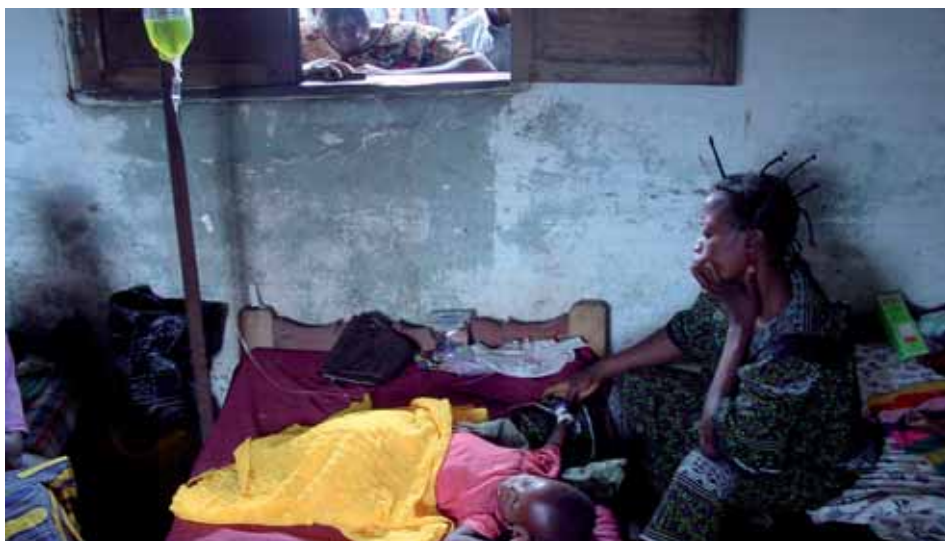
Africa needs better control of infectious diseases

Modern travel and tourism have been especially important in the spread of HIV/Aids. In addition, the growth in international trade and travel allows disease-bearing organisms, ranging from infected plants to malarial mosquitoes, to travel in